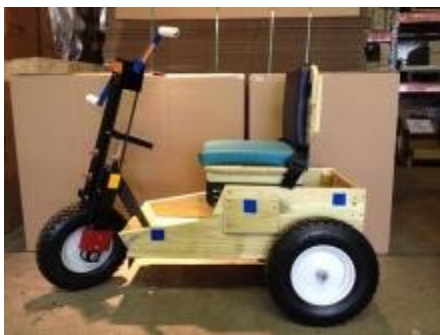
Adult crank PET. Other designs for children and for users not able to crank are available.