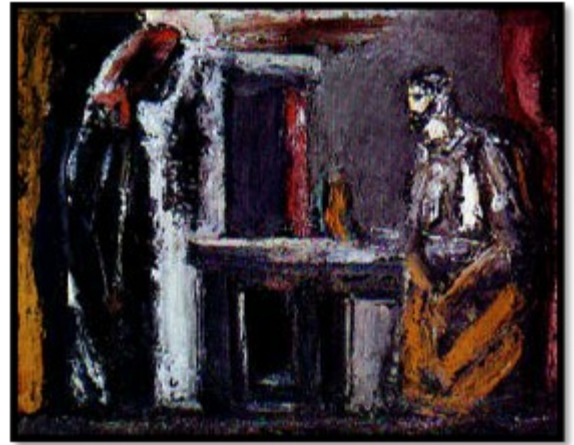
Jesus and the Samaritan Woman. Mario Sironi.

P.S. Small Group Sign-ups are currently taking place in the courtyard before and after worship.