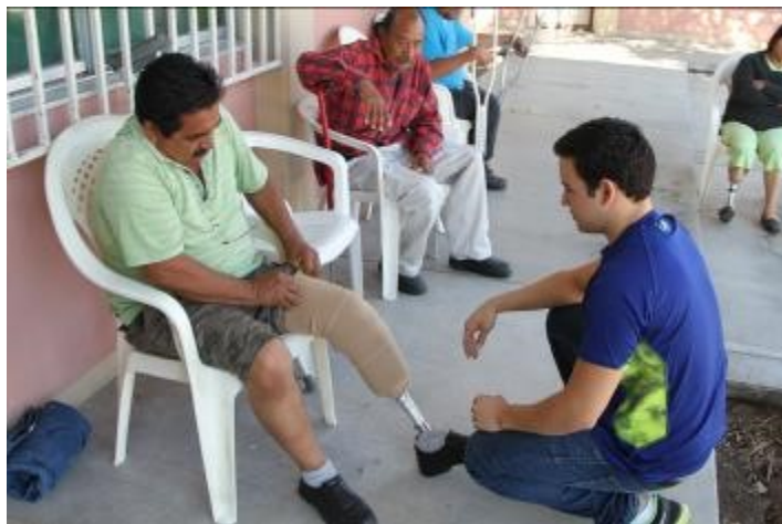
A clinic volunteer and a Limb Restoration Fund client in Mexico check out a prosthetic limb together.