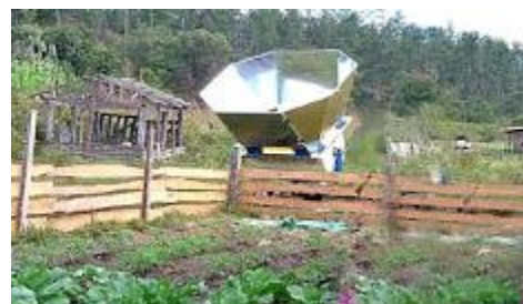
A solar oven like the one Thomas Food Project hopes to buy and install costs $15,000.