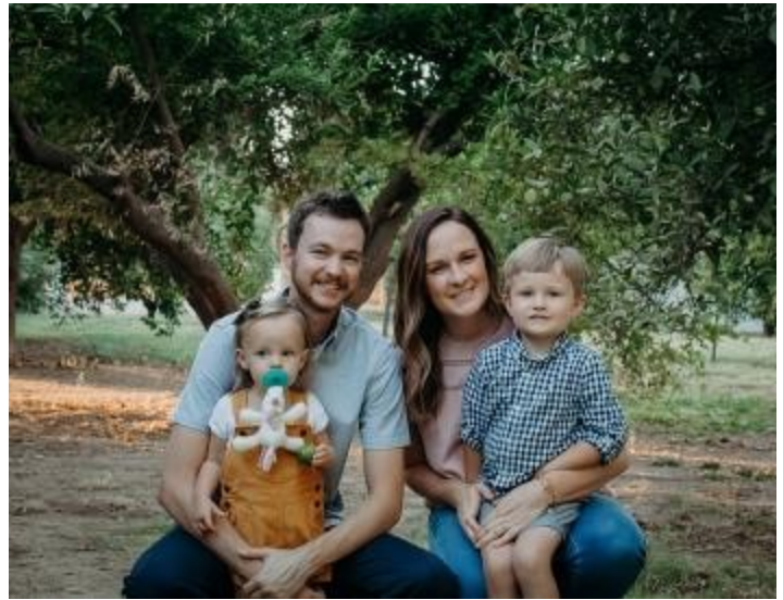
The Self family.

I love to cook, mostly because I love to eat, but you will probably see us around town a lot as soon as