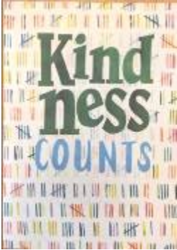
Cover of the Trinity Center thank-you card.