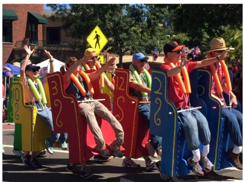
July 4, 2017