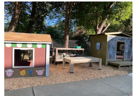
The preschool and playground are ready for action!