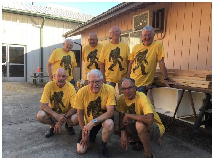
The Happy Camp mission team sporting T-shirts with their unofficial mascot.