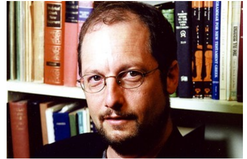
Prof. Bart Ehrman.