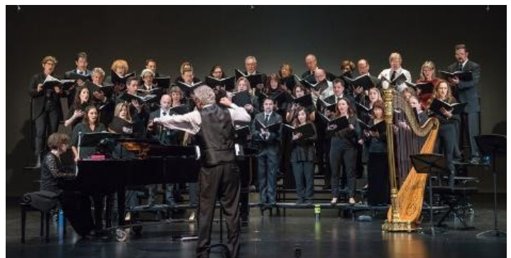
The San Ramon Valley Chorale in action.

People have a tendency to take blessings for granted in our day-to-day life, and just how much these blessings matter to us is often made most clear only when they're gone. For the Chorale, the