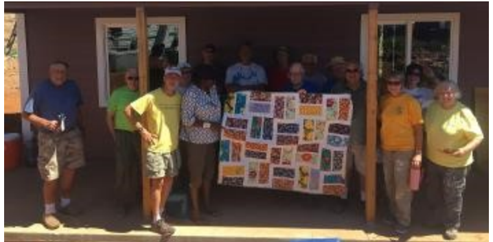
Top: Many happy hands make lighter work.