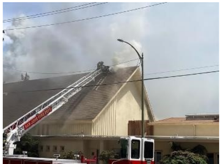
Above: From the June 8, 2022 fire.