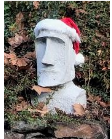
Photo: Ed the Head celebrates Christmas in his present Danville home.

As we packed up to move to Danville a few years later, a couple of passersby saw the moving truck and offered to buy Ed to keep him in the neighborhood. In my moment of spite, I'd accidentally created a community touchstone. God had tweaked my nose and reminded me that He is still bigger than me in my ugliest moments. While I was focused on spite toward one person, He was using the resulting behavior to bring some chuckles and smiles to a couple dozen neighbors I wouldn't meet for years.