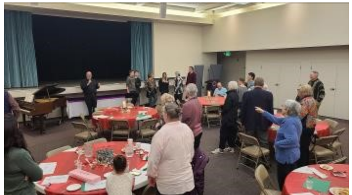
Above: Scenes from the youth spaghetti dinner fundraiser on March 18. Money raised supports mission work by our youth.